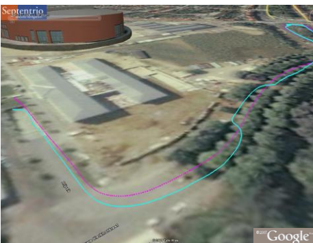
Integrated GNSS-IMU solution GNSS only solution

Signal blocking by buildings, trees, mountains and other obstructions provide limitations to applicability of GNSS in the most challenging professional applications requiring high-precision position data. Besides tracking GPS and GLONASS satellites, resulting in improved availability,